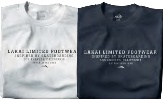
SURPLUS White / Navy