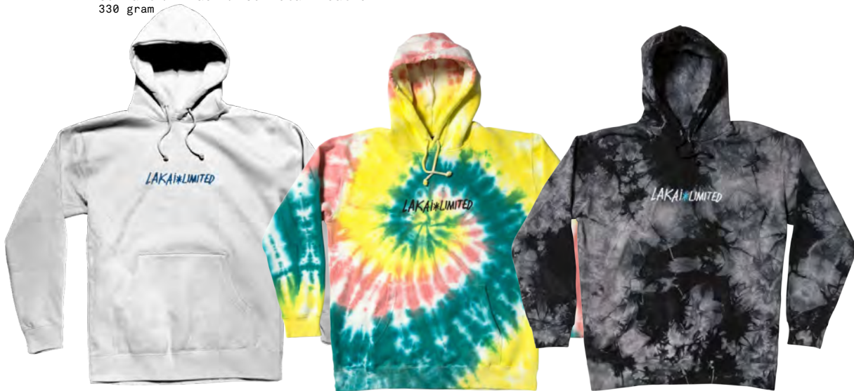
SHARPIE PULLOVER White / Multi Tie-Dye / Black Crystal Wash 330 gram with embroidered art