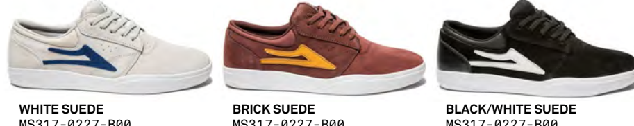
WHITE SUEDE MS317-0227-B00