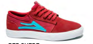
RED SUEDE KS317-0227-A00