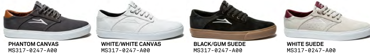
PHANTOM CANVAS MS317-0247-A00