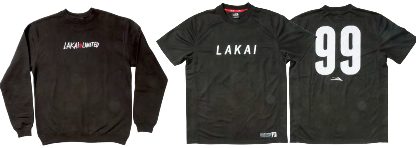
SHARPIE CREW Black 290gram with embroidered art