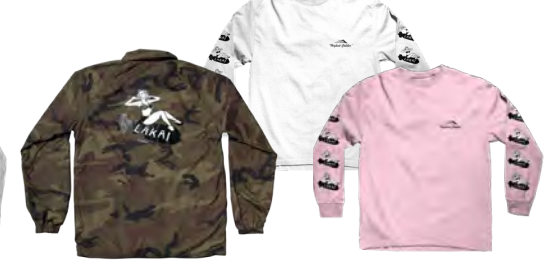
BOMBS AWAY JACKET LSW317615 Camo BOMBSHELL LS LTS317201 White / Pink