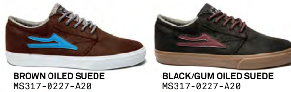
BROWN OILED SUEDE MS317-0227-A20