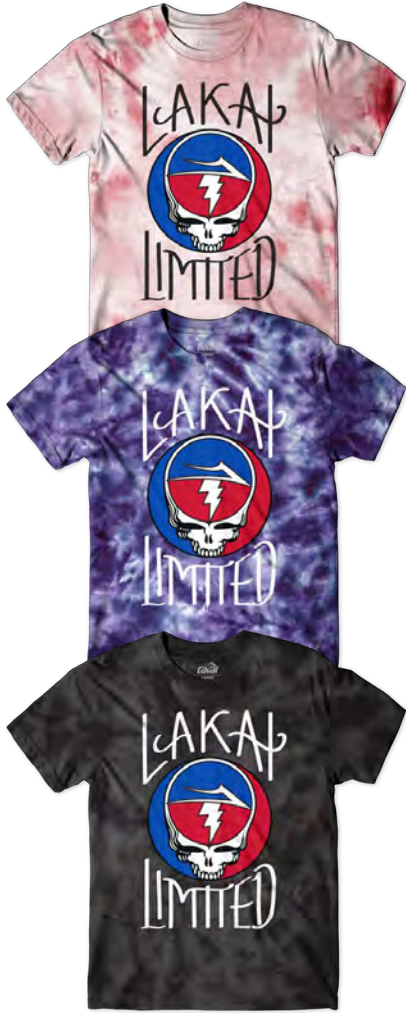
DEAD Red / Navy / Black Crystal Wash