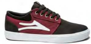
PORT CANVAS MS317-0227-A00