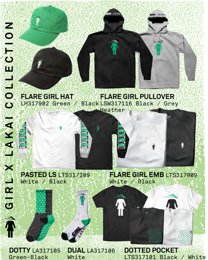
DOTTED POCKET LTS317101 Black / White