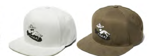
BOMBSHELL SNAPBACK LH317102 White / Jalapeno