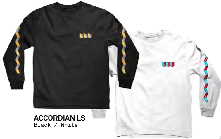
ACCORDIAN LS Black / White