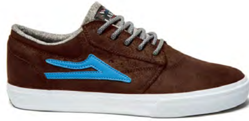
BROWN OILED SUEDE