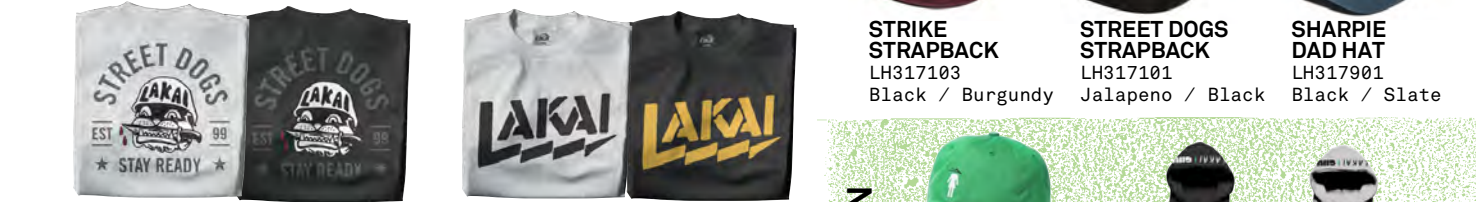
STREET DOGS LTS317001 Ash / Black