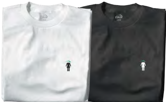
FLARE GIRL EMBROIDERY White / Black Embroidered art on chest