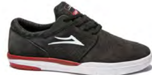
BLACK SUEDE MS317-0244-B00