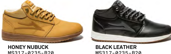
HONEY NUBUCK MS317-0235-B20