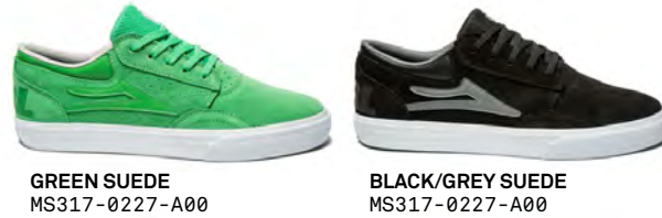
GREEN SUEDE MS317-0227-A00