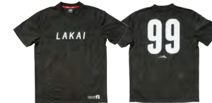
TOUR JERSEY LSW317300 Black