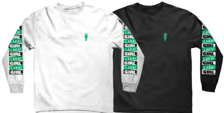
PASTED LS White / Black Embroidered art on chest