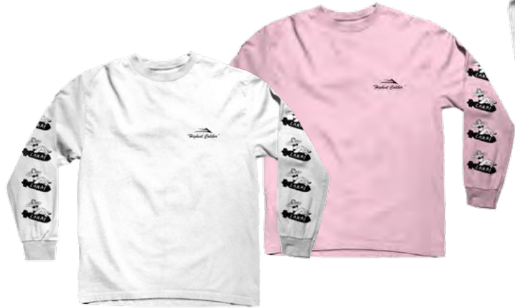
BOMBSHELL LS White / Pink