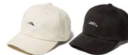
FLARE DAD HAT LH317900 Cream / Black