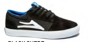
BLACK SUEDE KS317-0227-A00