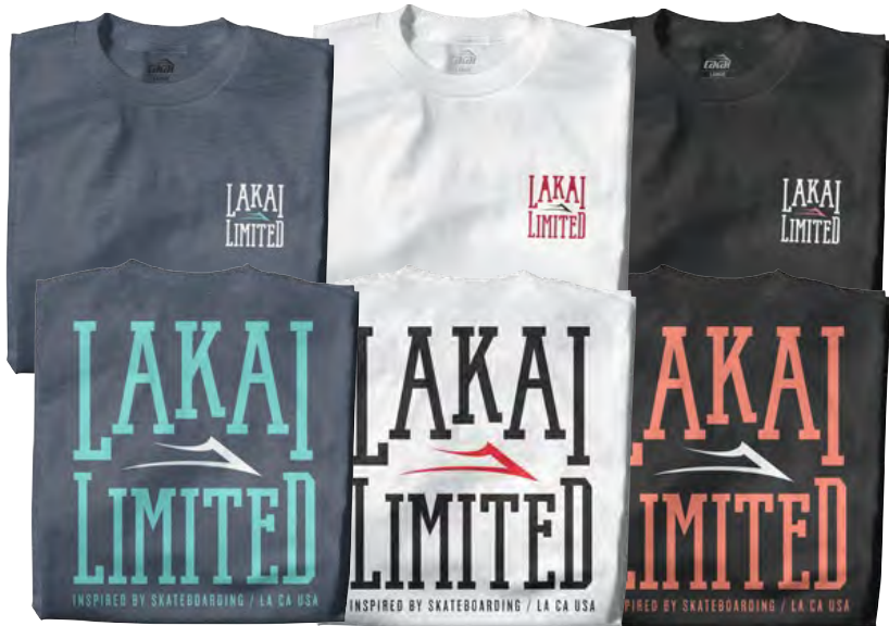
BOX Denim Heather / White / Black