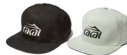
BASIC SNAPBACK LH317100 Black / Cement / Slate