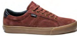
BRICK SUEDE MS317-0110-A00

FLACO STEVIE PEREZ PRO MODEL CO-BOUND LUX-LITE