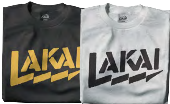
STRIKE Black / Ash