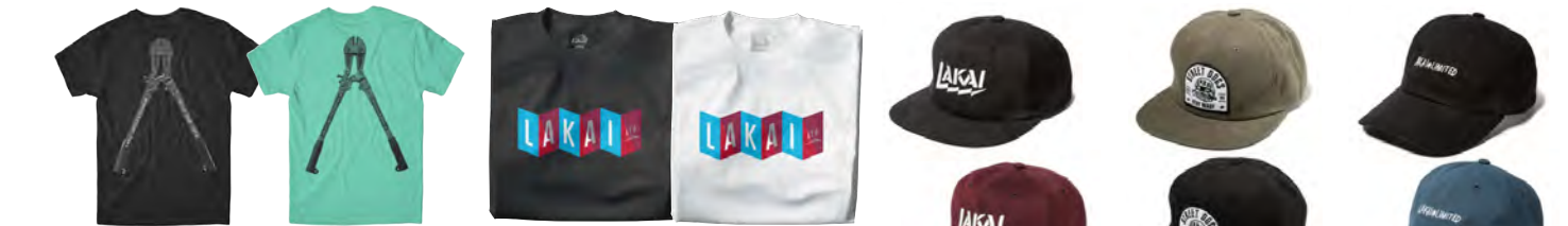
FUCK YOUR FENCE LTS317006 Black / Celadon