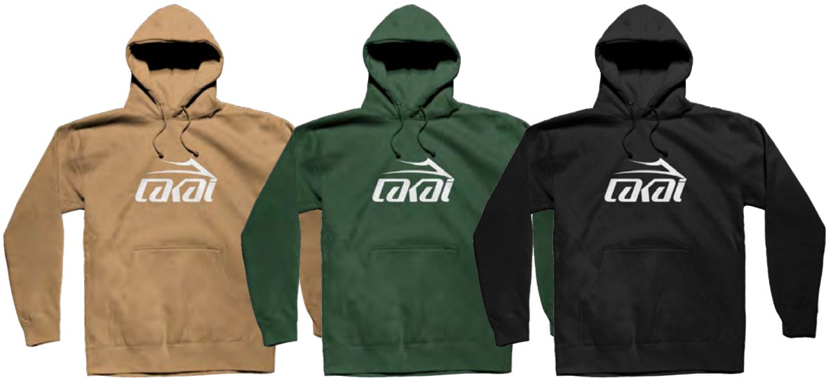
BASIC PULLOVER Sand / Forest / Black 330 gram