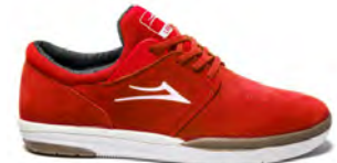
RED SUEDE MS317-0244-B00