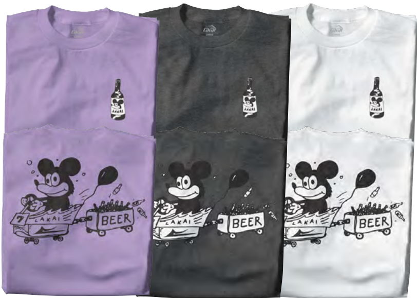
BEER Lavendar / Charcoal Heather / White