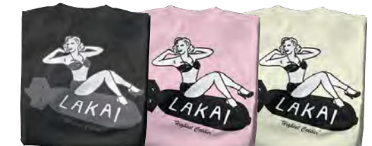
BOMBSHELL LTS317015 Black / Pink / Cream