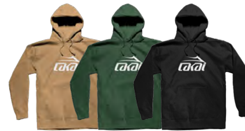
BASIC PULLOVER LSW317100 Sand / Forest / Black