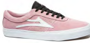
PINK SUEDE MS317-0101-A00