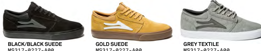
BLACK/BLACK SUEDE MS317-0227-A00