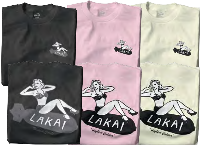
BOMBSHELL Black / Pink / Cream