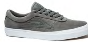
GREY SUEDE MS317-0101-A00