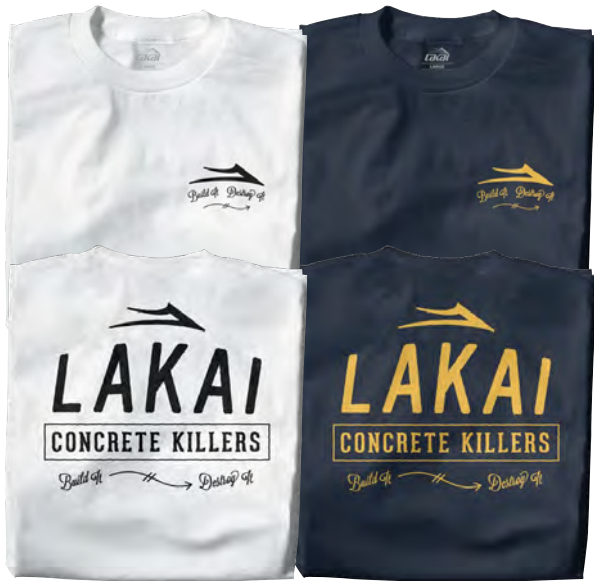
CONCRETE KILLERS White / Navy