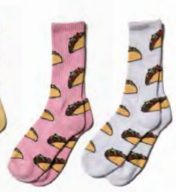
TACO CREW SOCK LA317104 Pink / White