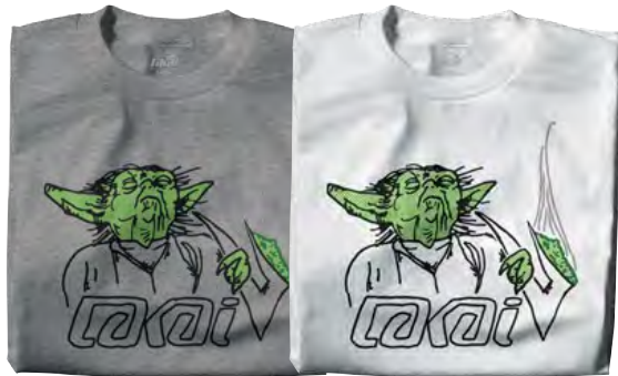
YODS Athletic Heather / White