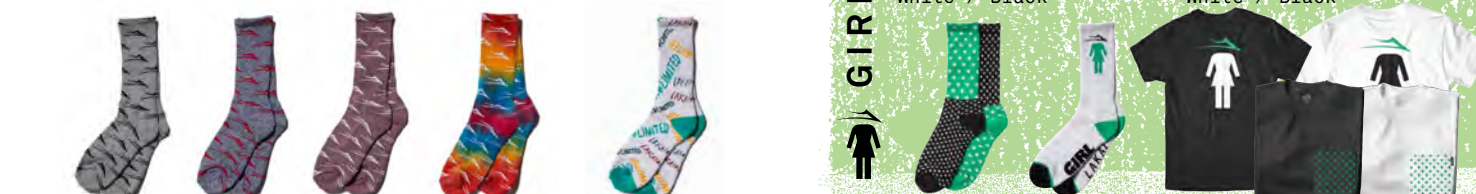
FLARE PATTERN CREW SOCK LA317100 Grey Marl / Navy Marl / Red Marl /