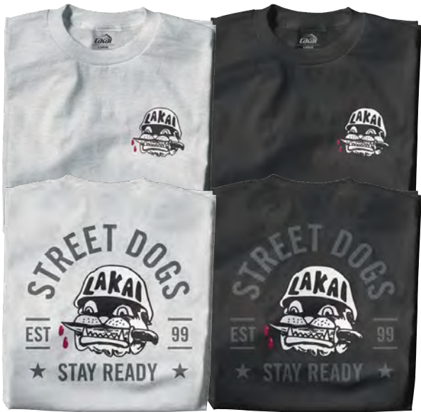
STREET DOGS Ash / Black