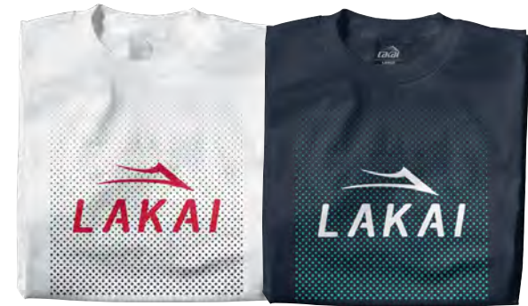
DOTTIE White / Navy Puff printed dots