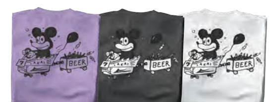
BEER LTS317007 Lavendar/ Charcoal Heather / White