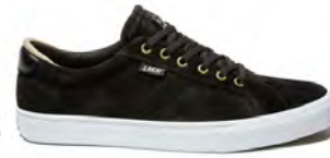
BLACK SUEDE MS317-0110-A00