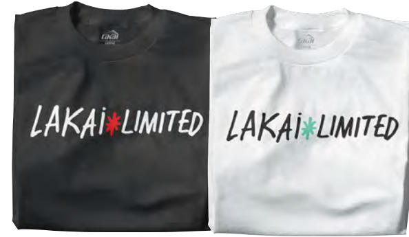
SHARPIE Black / White