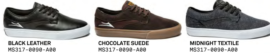
BLACK LEATHER MS317-0090-A00

RILEY HAWK RILEY HAWK PRO MODEL LUX-LITE