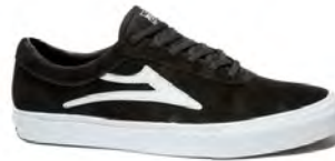
BLACK SUEDE MS317-0101-A00

FLACO STEVIE PEREZ PRO MODEL CO-BOUND LUX-LITE