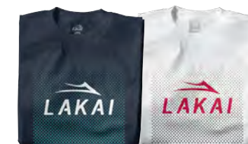
DOTTIE LTS317005 Navy / White