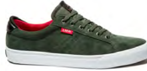
FOREST SUEDE MS317-0110-A00