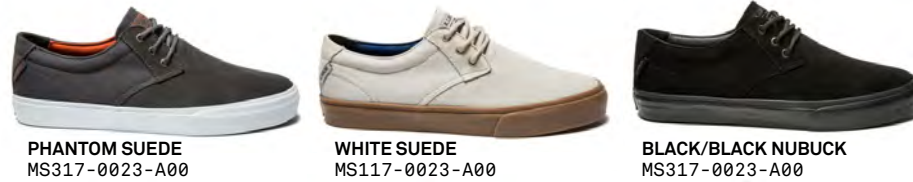
PHANTOM SUEDE MS317-0023-A00