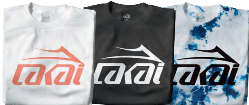
BASIC White / Black / Navy-White Crystal Wash