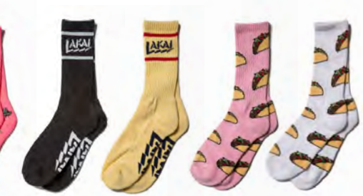
STRIKE CREW SOCK LA317102 Black / Yellow