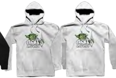
YODS PULLOVER LSW317112 Grey Heather / White