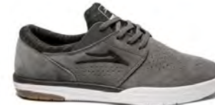
GREY SUEDE MS317-0244-B00