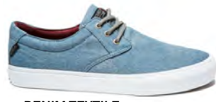
DENIM TEXTILE MS317-0023-A00