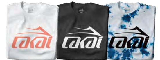
BASIC LTS317000 White / Black / Navy-White Crystal Wash