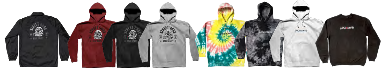
STREET DOGS JACKET LSW317601 Black