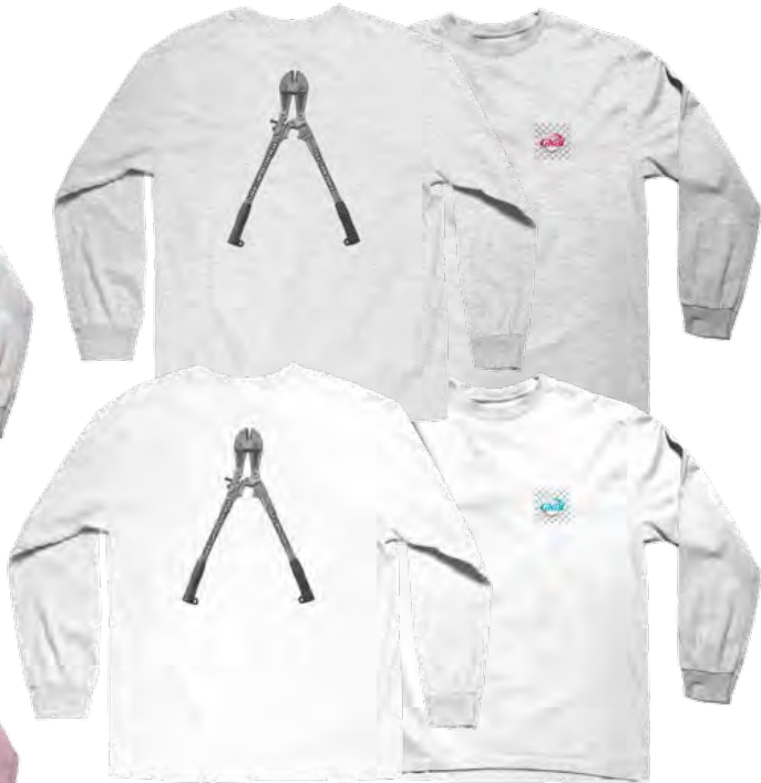
FUCK YOUR FENCE LS Ash / White