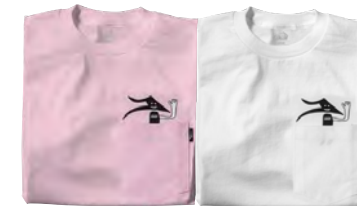
FLARE FACE POCKET LTS317100 Pink / White