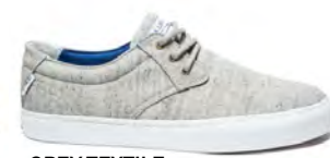
GREY TEXTILE MS317-0023-A00