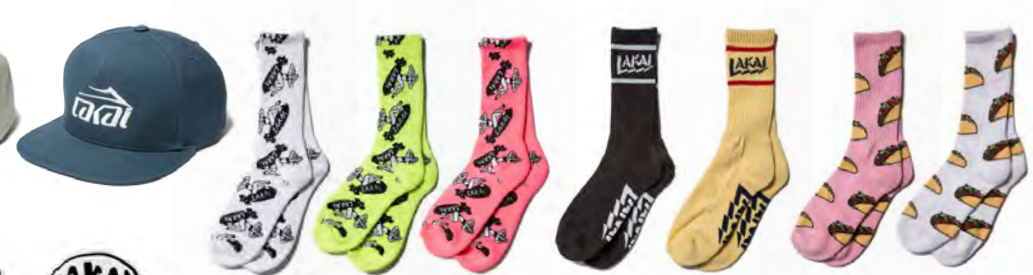
BOMBSHELL CREW SOCK LA317103 White / Neon Yellow / Neon Pink