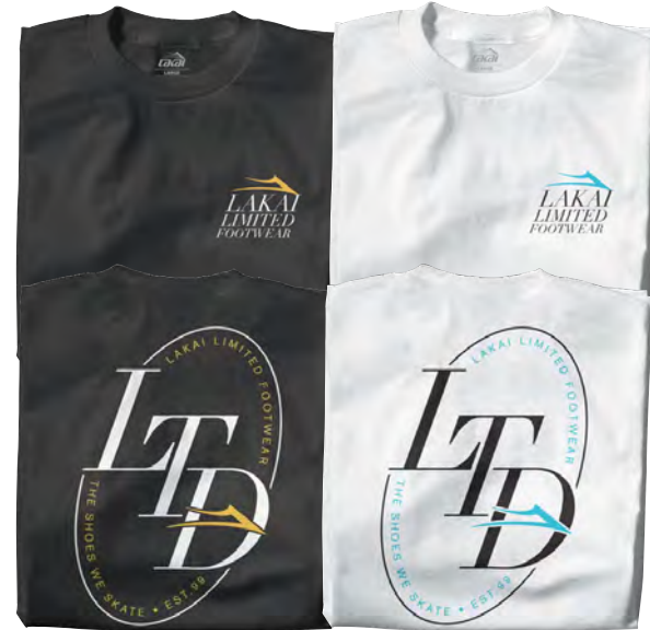
LTD Black / White