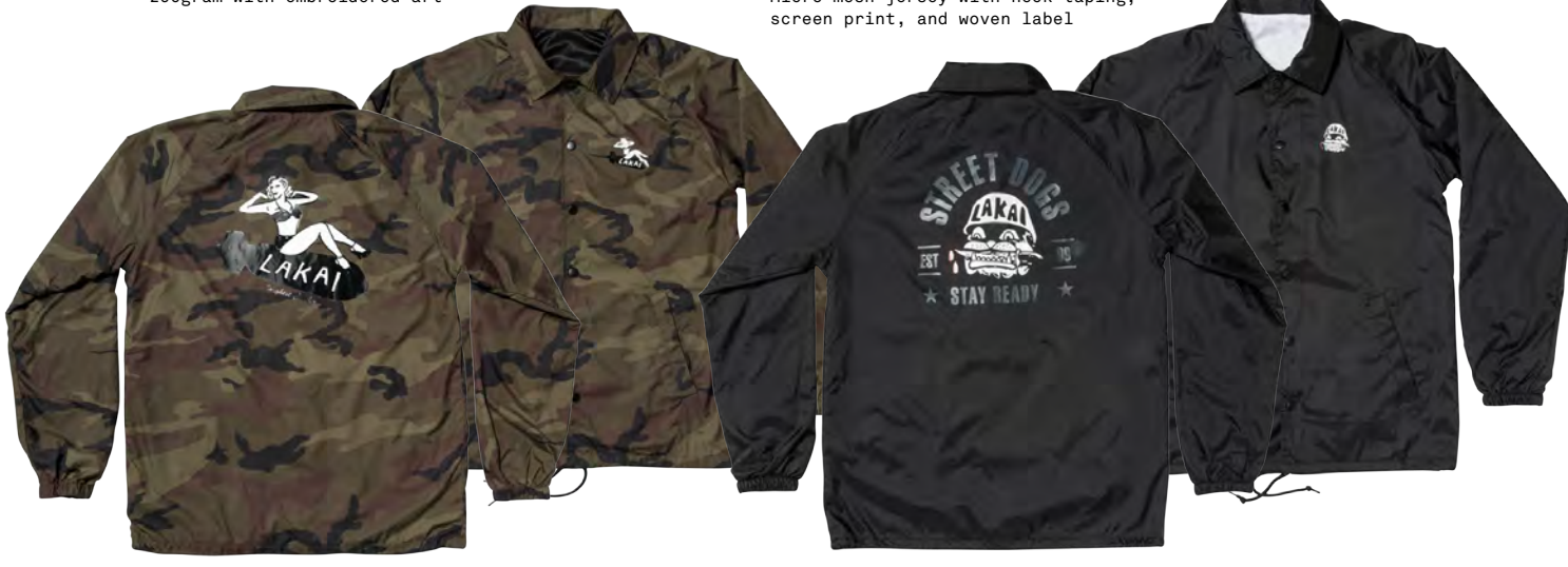
BOMBS AWAY COACH'S JACKET Camo