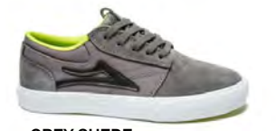
GREY SUEDE KS317-0227-A00