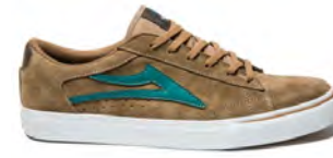
WALNUT SUEDE MS317-0246-A00