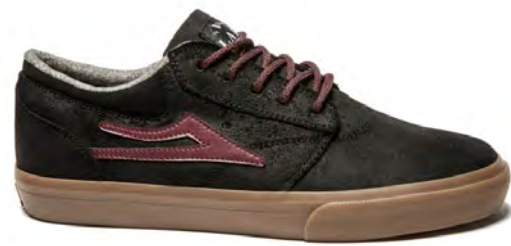
BLACK/GUM OILED SUEDE

The Weather Treated Griffin takes our team-favorite silhouette, and transforms it into a shoe that can withstand the elements without sacrificing skate-ability. The upper has been upgraded with water repellent oiled suede, while the internal features of the shoe have been updated with wool and moisture wicking fabric to maintain warmth. It has also been given an upgraded gusseted tongue to prevent debris and water from entering the shoe through the lace eyelets. The Weather Treated Griffin is the perfect shoe for daily wear in climates with light rain and damp conditions.