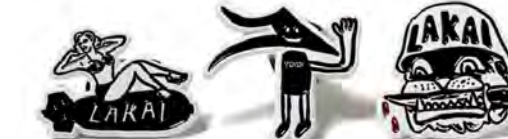
BOMBS AWAY PIN LA317900 Black-White FLARE FACE PIN LA317901 Black-White STREET DOGS PIN LA317902 Black-White