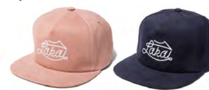
LARIAT STRAPBACK LH317108 Rose / Navy