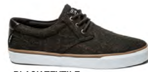
BLACK TEXTILE MS317-0023-A00