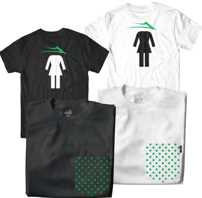
DOTTED POCKET Black / White