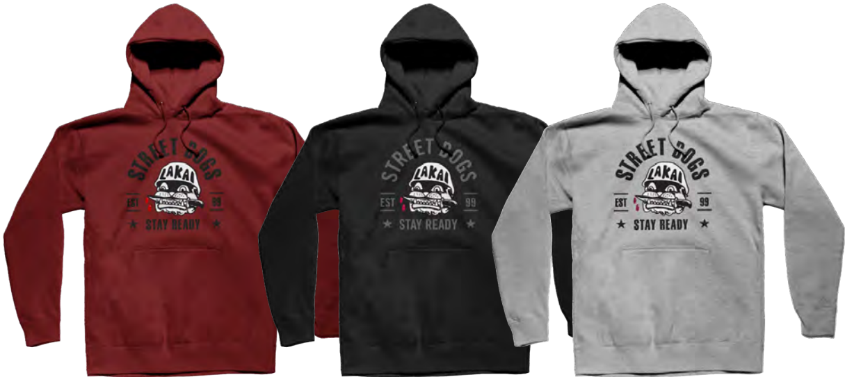
STREET DOGS PULLOVER Currant / Black / Gunmetal Heather 330 gram