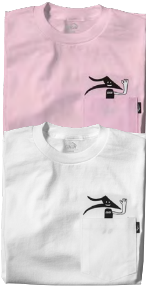
FLARE FACE POCKET Pink / White