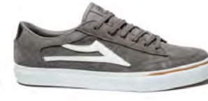
GREY/WHITE SUEDE MS317-0246-A00