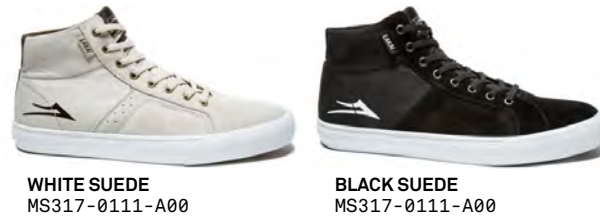
WHITE SUEDE MS317-0111-A00