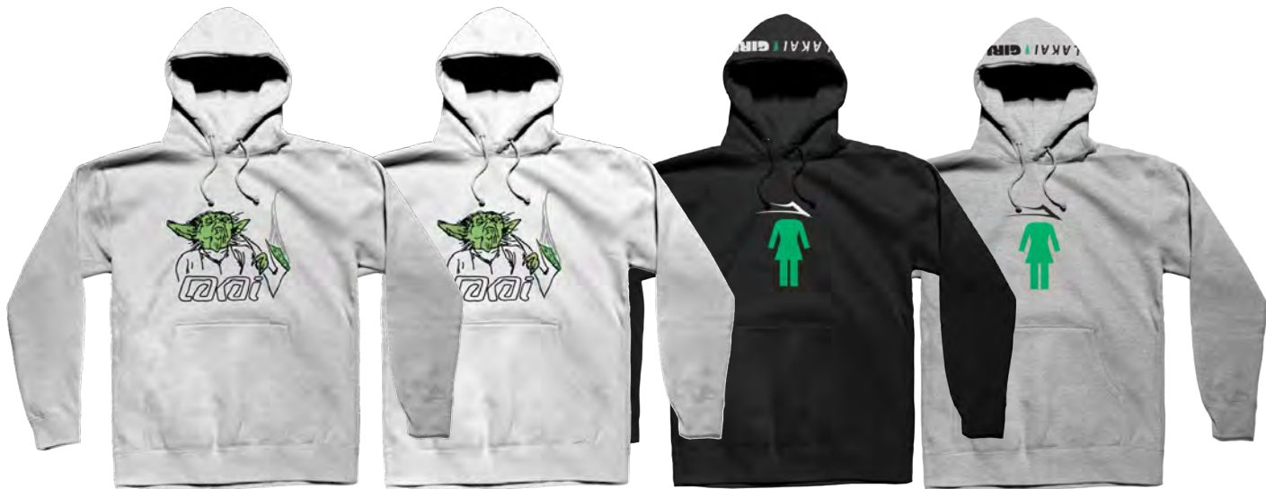
YODS PULLOVER Grey Heather / White 330 gram