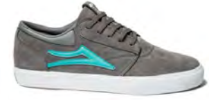
GREY SUEDE MS317-0227-A00