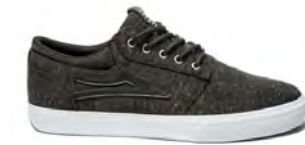
BLACK TEXTILE MS317-0227-A00