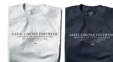
SURPLUS LTS317013 White / Navy