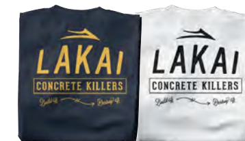
CONCRETE KILLERS LTS317002 Navy / White