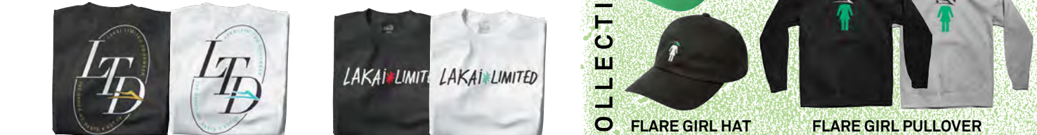
LTD LTS317003 Black / White