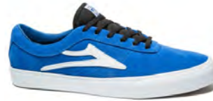
BLUE SUEDE MS317-0101-A00

NEW STYLE! SHEFFIELD LUX-LITE ADVISED STYLE