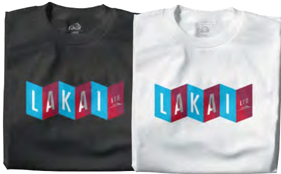
ACCORDIAN Black / White