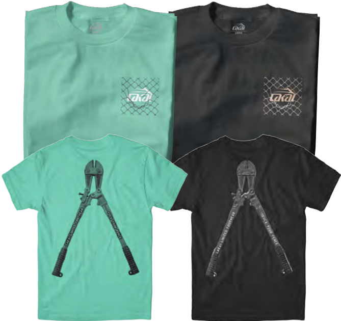
FUCK YOUR FENCE Celadon / Black