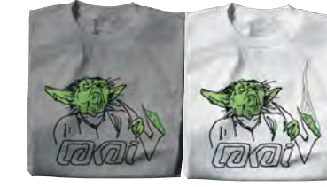
YODS LTS317012 Athletic Heather / White